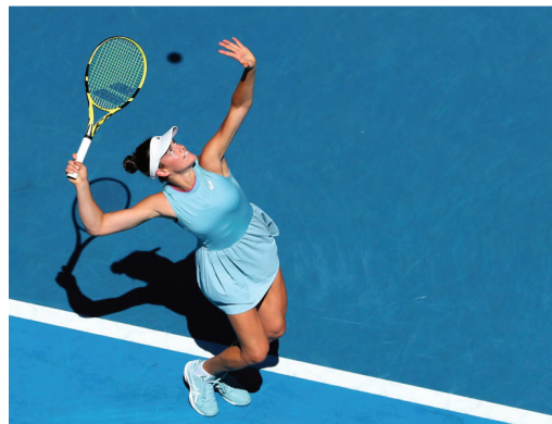
Jennifer Brady Australian Open Finalist Ascension Women's Open Champion

Federal Tax Identification Number: 35-2570085